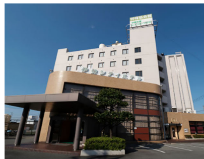
Ise City Hotel