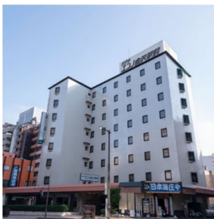
Hotel Econo Kanazawa Ekimae