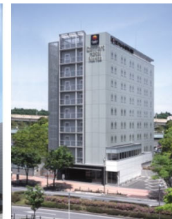
Comfort Hotel Narita