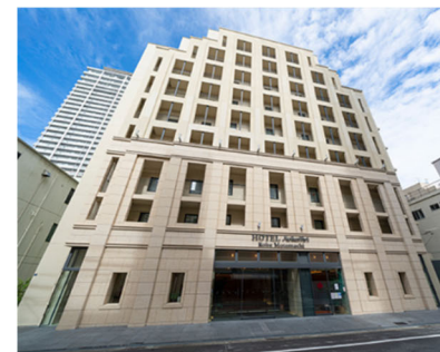
HOTEL Meriken Port Kobe Motomachi