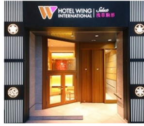
Hotel Wing International Select Asakusa Komagata