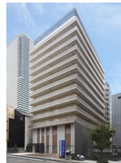
Comfort Hotel Kobe Sannomiya