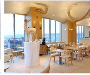
Hotel Wing International Premium Kanazawa Ekimae