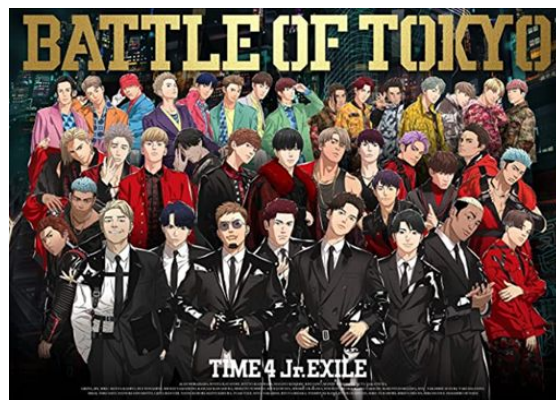
GENERATIONS, THE RAMPAGE, FANTASTICS, BALLISTIK BOYZ from EXILE TRIBE