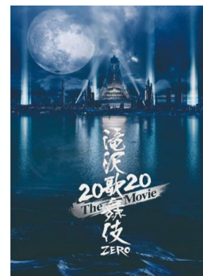
“Takizawa Kabuki ZERO 2020 The Movie”starring Snow Man