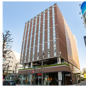
Hotel Wing International Premium Shibuya