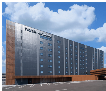
Hotel around TAKAYAMA