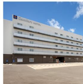
Comfort Hotel Ishigakijima