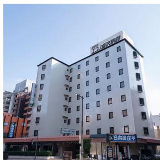
Hotel Econo Kanazawa Ekimae