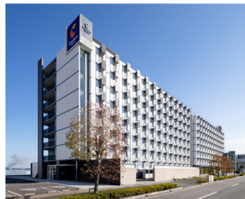
Comfort Hotel Central International Airport (Ichigo Hotel-Owned)