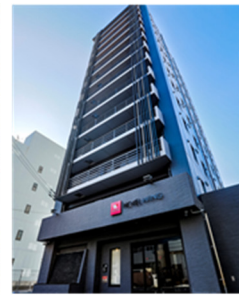
Hotel Wing International Takamatsu