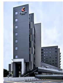
Comfort Hotel Nagoya Kanayama