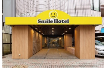
Smile Hotel Tokyo Asagaya (Ichigo Hotel-Owned)