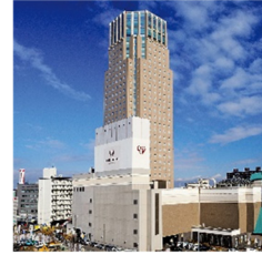
Hotel Emisia Sapporo