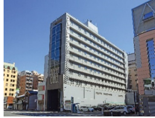
Smile Hotel Kyoto Shijo (Ichigo Hotel-Owned)