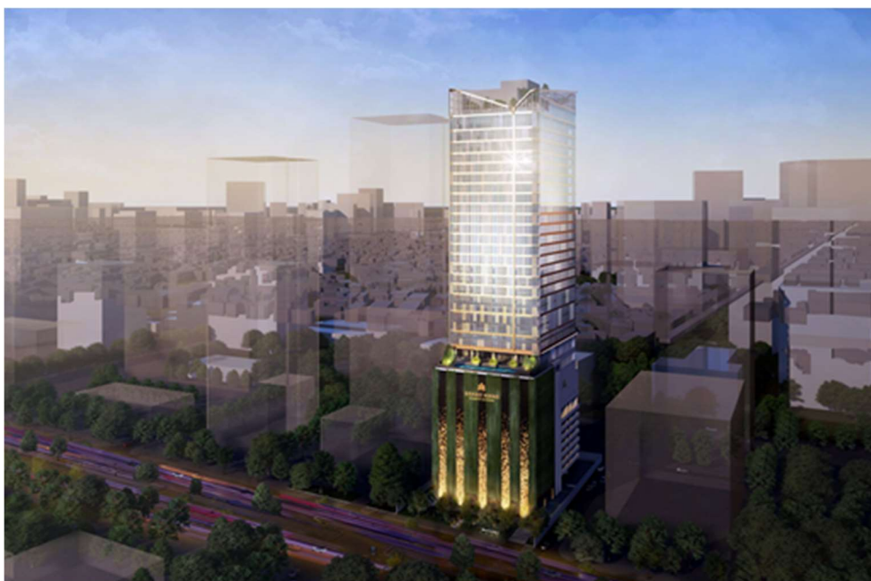
Rendition of Grand Nikko Bangkok Sathorn