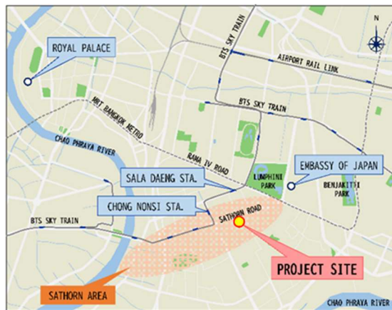
Narrow area map

“The Grand Nikko Bangkok Sathorn” is conveniently located on the major thoroughfare, Sathorn Road, a 40-minute drive from Suvarnabhumi International Airport and a 5-minute walk from Chong Nonsi Station on the BTS Silom Line. Based on the concept of “comfort that unleashes the five senses in a high-quality environment”, the Grand Nikko, incorporating the luxury brand of Nikko Hotels International, promises guests a relaxing stay in a space offering a complete sense of freedom.