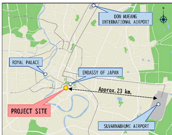
Wide area map

restaurants featuring world-famous and up-and-coming chefs. Although it is a business district, there is also a lush green area represented by Lumpini Park, and the area around Sathorn Road and the BTS (Skytrain) station is home to luxury condominiums and serviced apartments, making it ideal for living a metropolitan lifestyle.