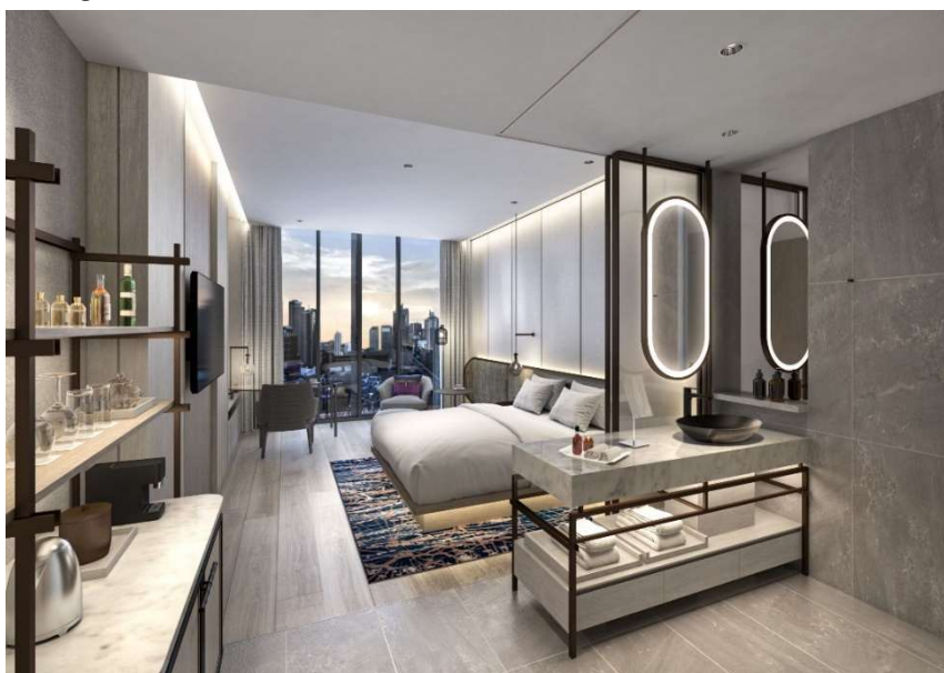
Rendition of Guest Room in the Grand Nikko Bangkok Sathorn

The hotel will also offer executive lounge, fitness center, spa and banquet facilities to support both leisure and business guests.