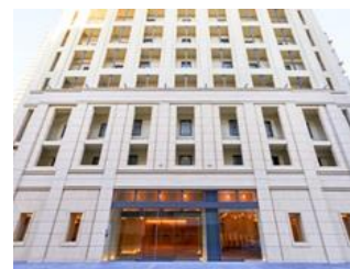
Hotel Meriken Port Kobe Motomachi