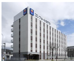
Comfort Hotel Kitakami (Owned by MIRAI)