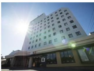
Ise City Hotel Annex (Owned by MIRAI)