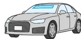
Usage of the transparent antenna (image)