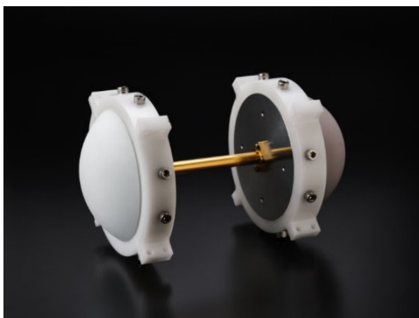
Repeater using radio wave lenses