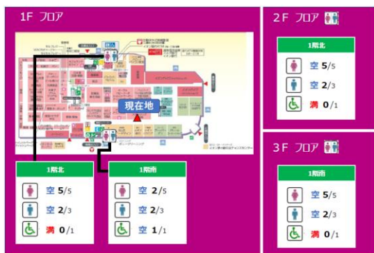
● Image of the display screen on digital signage

The service visualizes restroom availabilities on a digital signages. By installing the digital signages in crowded areas of facilities, users can check the status.