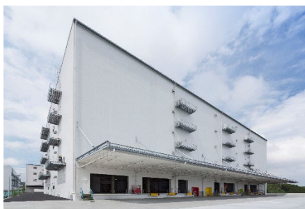
IIF Yokkaichi Logistics Center (New Building) External View