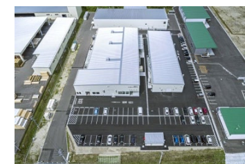
Tomiya Factory, producing semiconductor manufacturing equipment parts and silicon nitride substrates