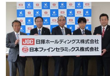
Location announcement ceremony for new site