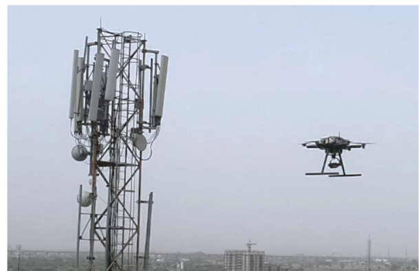
Scene of Drone Flight at India