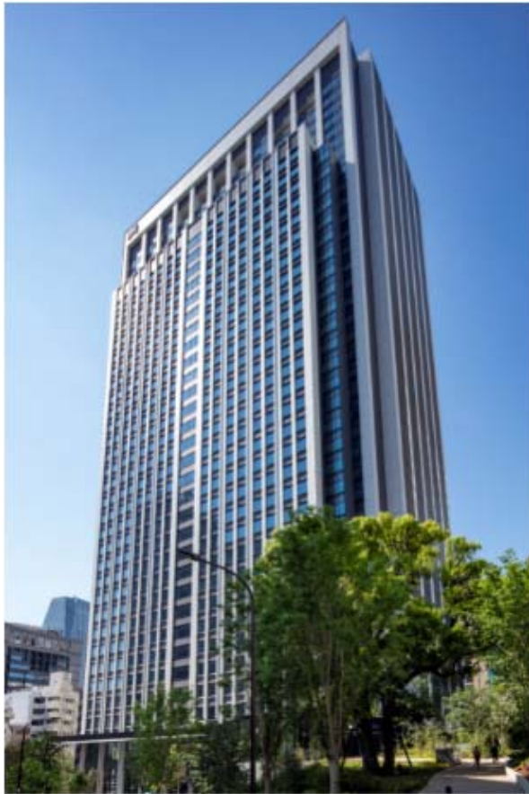
Photograph of the Property, Vicinity MAP of the Property