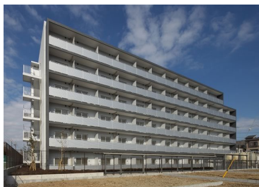
Kawasaki Sakuramoto WEST

This English language release is for informational purposes only, and the Japanese language release should be referred to as the original.