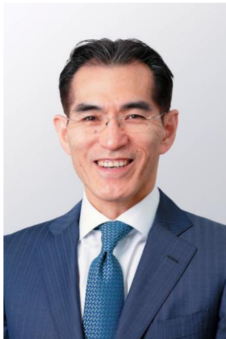
Representative Director and President