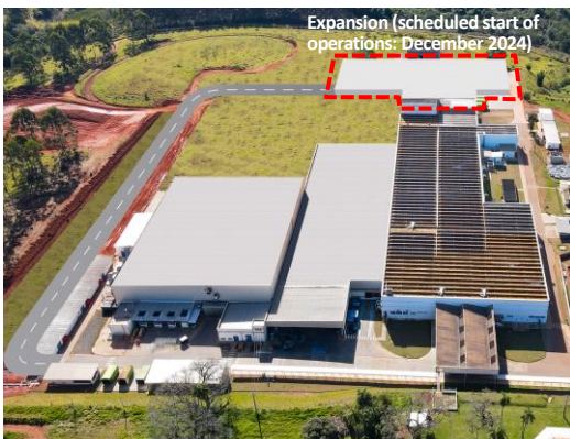
After completion of new wing