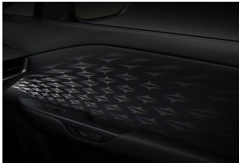
Shadow illumination LED lamp unit

The newly-developed illumination product can provide different light colors and pattern variations. Different appearances are also expressed depending on the interior materials, which will contribute to diversity of interior design suitable to vehicle grade.