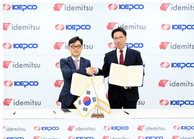
MOU signing ceremony (April 14, 2023)

This initiative is positioned as an effort to develop and socially implement "Energy one step ahead" among the three business domains that Idemitsu has identified to realize a carbon-neutral society by 2050. Idemitsu will continue to contribute to the realization of a carbon-neutral society through collaboration with various leading companies in Japan and abroad.