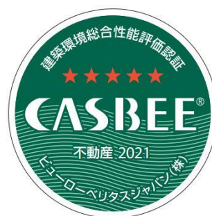
CASBEE Certification for Real Estate S Rank