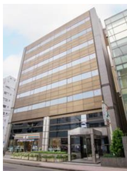
MI Terrace Sendai Hirose-dori

MI Terrace Sendai Hirose-dori (formerly known as Manulife Place Sendai), which was acquired in November 2022, has also held the CASBEE Certification for Real Estate S Rank, and together with BizMiiX Yodoyabashi, the proportion of assets with environmental certification as of today is 74.7%.