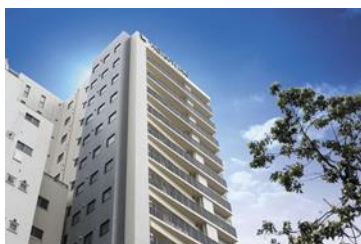
Hotel Wing International Select Ueno/Okachimachi (Owned by MIRAI)