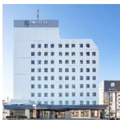
EN HOTEL Ise (Owned by MIRAI)