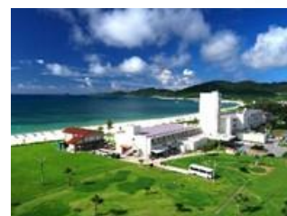
KUMEJIMA EEF BEACH HOTEL