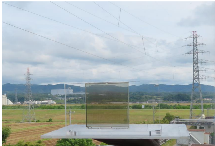
Fig.1 Small prototype of transparent liquid crystal meta-surface reflector for mmWave.

Japan Display Inc. today announced the development of the world’s first transparent liquid crystal meta-surface reflector that can change the direction of mmWave reflection to any direction. The transparent liquid crystal meta-surface reflector can be placed on window glass or on advertising media, and generally in any environment or location where transparency offers added benefits, which greatly increases installation flexibility. As a result, the radio communication environment of mmWave is greatly improved, contributing to greater convenience for consumers:-