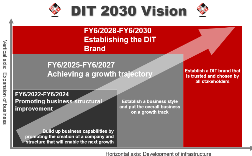
Medium-term Growth Model

the next growth. We also set the period from FY6/25 to FY6/27 as the period for "achieving a growth trajectory" to establish a business style and put the overall business on a growth track, and the period from FY6/28 to FY6/30 as the period for "establishing the DIT brand", that is trusted and chosen by all stakeholders.