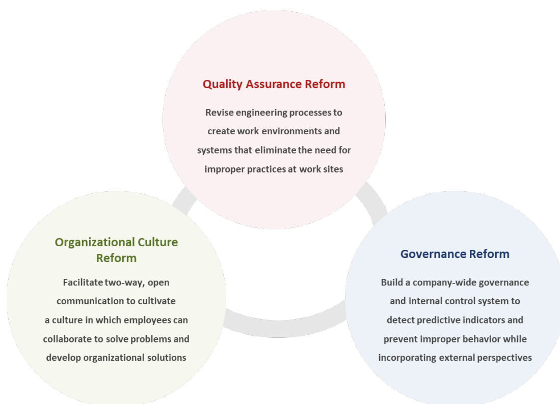
Overview of the Three Key Reforms

In collaboration with the company-wide transformation project, the Company will make every effort to transform itself towards creating a new Mitsubishi Electric by enhancing and developing the Three Key Reforms of quality assurance, organizational culture, and governance.