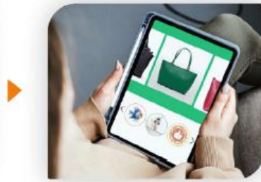
Customized by customers