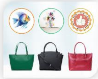
prepare the base products and images

Base products can be chosen from the introducing company's own products or OEM products offered by CustoMee.