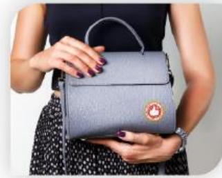
Completion of the original products