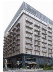
HOTEL THE KNOT YOKOHAMA (Ichigo Hotel-Owned)