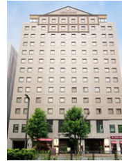
Hotel Wing International Premium Tokyo Yotsuya