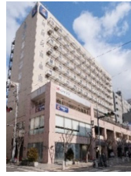
Comfort Hotel Osaka Shinsaibashi (Ichigo Hotel-Owned)