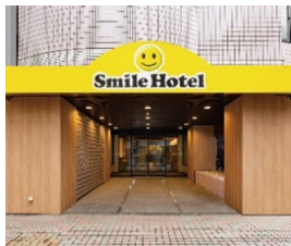
Smile Hotel Tokyo Asagaya (Ichigo Hotel-Owned)

1 Some hotels are operated by related parties and franchisees of Hospitality Operations.