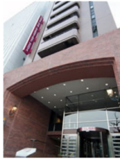
Hotel Wing International Nagoya (Ichigo Hotel-Owned)