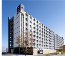
Comfort Hotel Central International Airport (Ichigo Hotel-Owned)