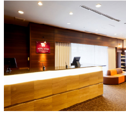
Hotel Wing International Kobe Shin Nagata Ekimae (Ichigo Hotel-Owned)