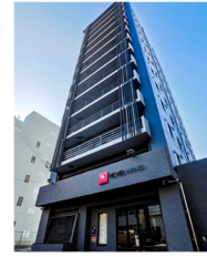
Hotel Wing International Takamatsu