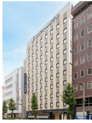
Comfort Hotel Hamamatsu (Ichigo Hotel-Owned)