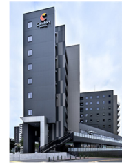
Comfort Hotel Nagoya Kanayama