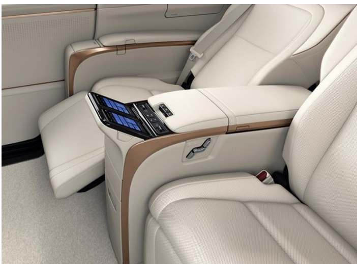
Armrest with heater (rear seats)

* As of September 30, 2023, according to a survey by Toyota Gosei