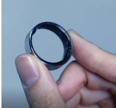
Virgo Smart Ring