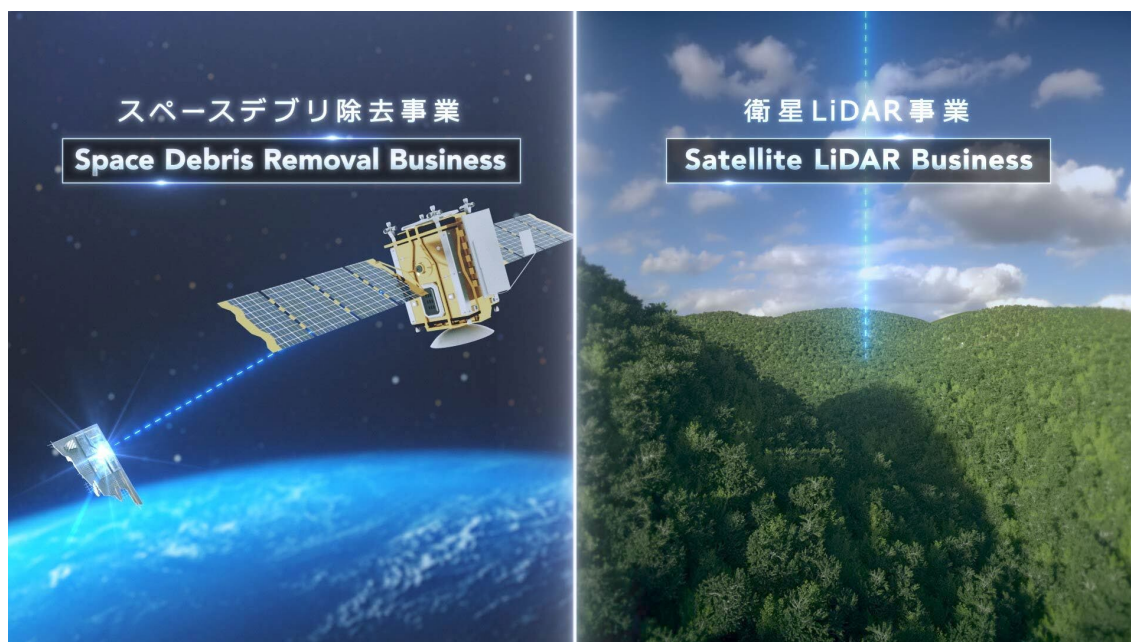
Image of Orbital Lasers' businesses

In our everyday lives, we use information from space for various purposes, including weather forecasts and GPS location data, contributing to the establishment of a secure society and enhancing our overall well-being. Moreover, space-based services play a crucial role in disaster situations, offering a valuable means to assess the extent of damage and facilitate emergency communication. The significance of space systems, as infrastructure supporting the economy and society, is anticipated to continue to increase in the future.*4