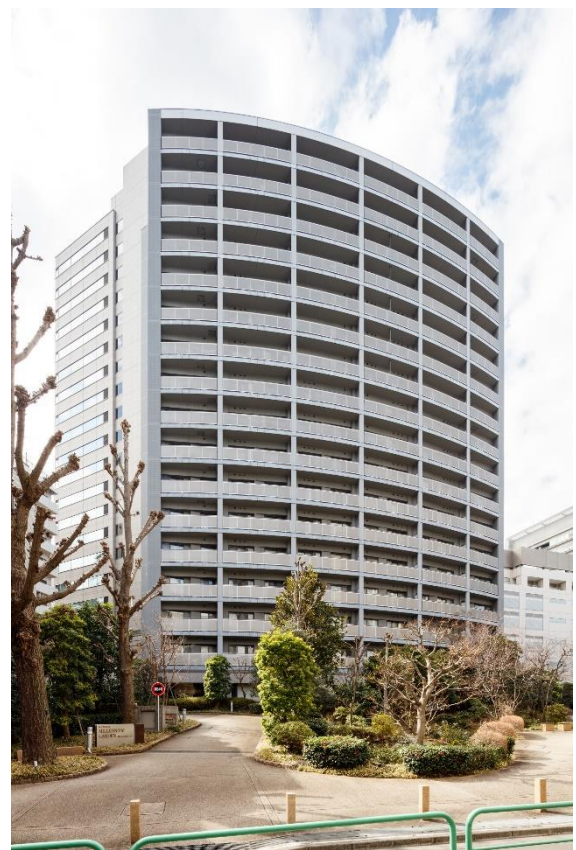
Residence (Additional acquisition target)